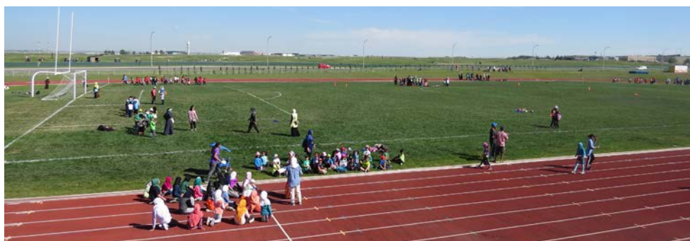
Track and Field