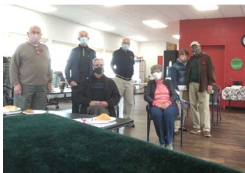
Calgary Airport White Hat Volunteer Get Together