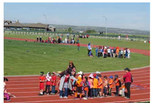
Track & Field / Summer Camps