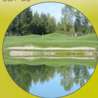
McKenzie Meadows Golf and Country Club

Threesomes-On each shot (including putts) one player can shoot twice.